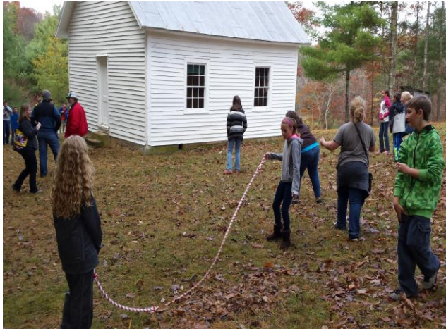
Willis Elementary at Double Springs School