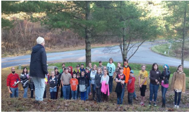
Children from Willis Elementary School arriving at Double Springs School.